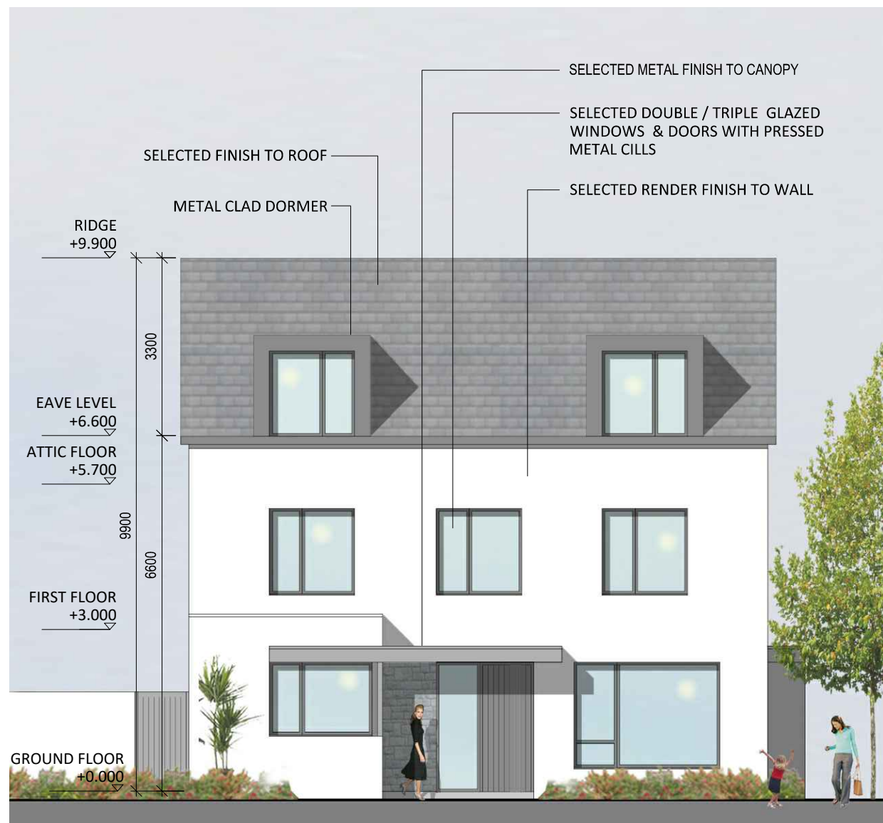
FRONT ELEVATION scale 1:100